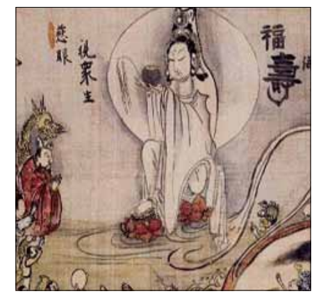
The Buddha about to preach the most profound teaching and the highest truth